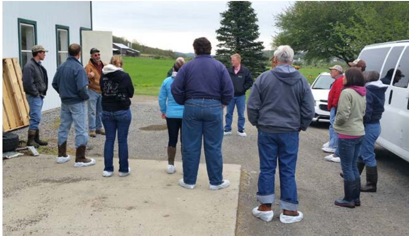
Additional photos taken of the AG BMP Tour held on April 28, 2016.