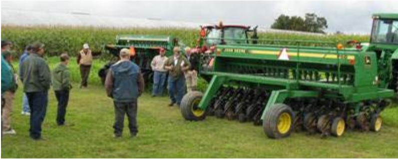
Hooper, Inc. and Valley Ag & Turf prepare to show off their no-till drills during the Field Day.