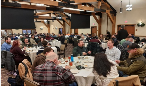
Left: Approximately 95 attendees during the workshop.