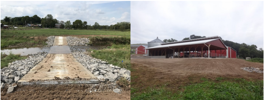
Left: Stream crossing installed along Susquehecka Creek in Franklin Township, Snyder County.

*Example picture of (*) BMP installed at a Snyder County operation.