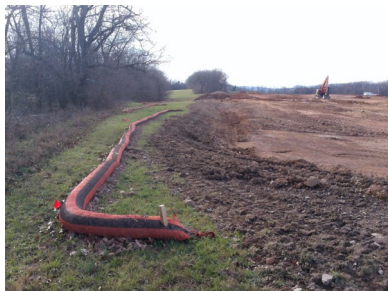
Silt sock placed at an NPDES site.

Contracted: Dirt and Gravel Roads —$106,265.70 Low Volume Roads —$165,000.00