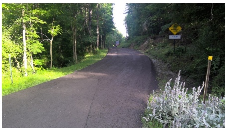
DSA placement on Long Hill Road.