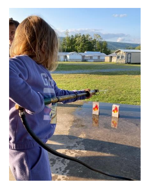
<u>Top Left Photo:</u> Youngsters "make it rain" with spray bottles on two model stream tables. The left model showcases streamside best management practices (BMP) such as riparian buffers which protect the streambank and water quality. The right model has no streambank protection BMPs. <u>Top Right Photo:</u> A young person prepares to "put out" a wildfire. <u>Bottom Photos:</u> Children look at various tree seeds and cones.