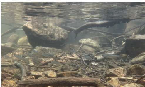
Above: Look closely to see some of the newly released

The highlight of a day of activities learning about stream health and stream macroinvertebrates is of course the release of the Trout that the students worked so long and hard to carefully raise.