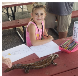
Above: A big smile while learning about PA's State Amphibian , the Hellbender

The Snyder County and Juniata County Conservation Districts hosted the fourth Kids Envirocamp. A variety of staff and partners discussed many topics relating to aquatics, forestry, soil, and wildlife including a live bear making a guest appearance for one night. This program is always a summer favorite of staff and the Enviro Campers alike.