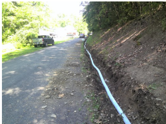
Installation of Underdrain on Bailey Hill Road, Beaver Township