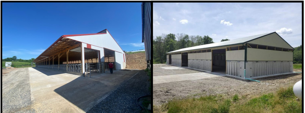
Below: Roofed HUA with manure storage for dairy (left) and Poultry waste storage facility (right)