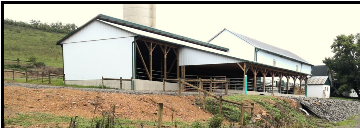
Above: Roofed Heavy Use Area (HUA) and manure storage for beef.

Utilizing funds from the Agricultural Conservation Assistance Program (ACAP), Countywide Action Plan (CAP) implementation funds, and National Fish and Wildlife (NFWF) funds, (5) poultry waste storage facilities and (3) Heavy Use Areas/Barnyard improvement projects were completed in 2024.