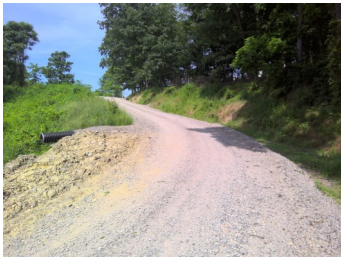
Rock Fill and Drainage Improvements on Arnold Road, Chapman Township